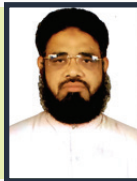
M.A. SALAM INDIA MA Islamic Studies